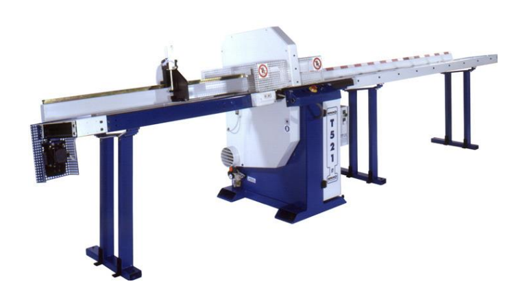
Foot pedal operated Cut-off saws for large scale production w/ 20" saw blade

Pneumatic adjustable speed up-stroke pneumatically activated through a foot pedal control. Automatic workpiece clamping in cycle with blade stroke. The clamp also acts as the blade guard and ensures total safety for the operator. The unit is best suited for length cutting and defect removal. On request T 521 ST can be equipped with infeed and out feed roller table with scale for positioning of manual or pneumatic flip over stops.