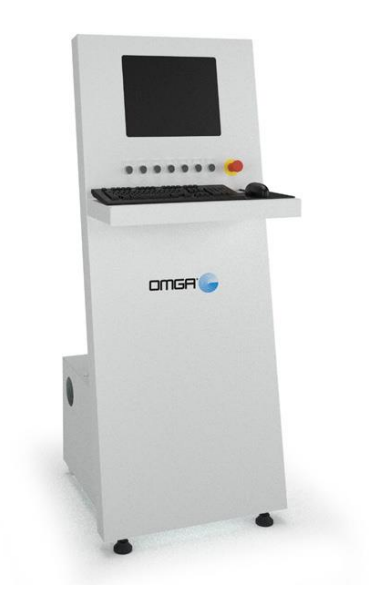
Detail of PC console