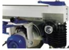
Detail of Automatic Head Return