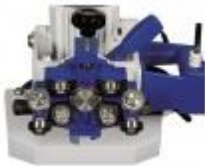
Details of 8 bearings