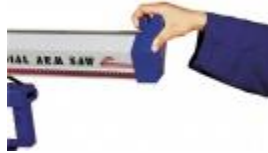
Detail of Front Unlocking System