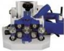
Details of 8 Bearings