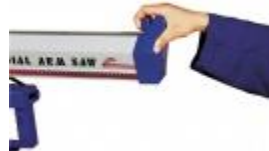
Detail of Front Unlocking System